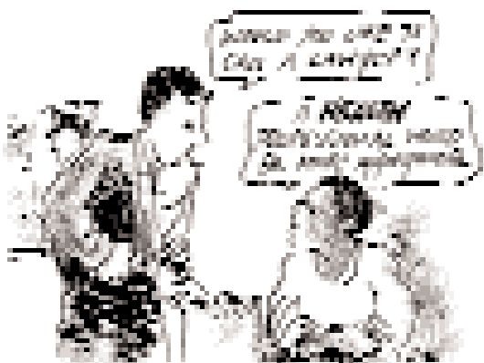
Thanks to Simon Kneebone Copyright 2002

The emergence of the 'treatment works' mantra followed from the highly influential National Treatment Outcome Research Study (NTORS) (22) with its headline conclusion that every pound spent on treatment saved three pounds in criminal justice expenditure. To this end, increasing Home Office budgets have been directed into criminal justice-administered treatment, and a proportion of local police budgets is similarly redirected to local drug services. But there are two serious problems with this strategy.