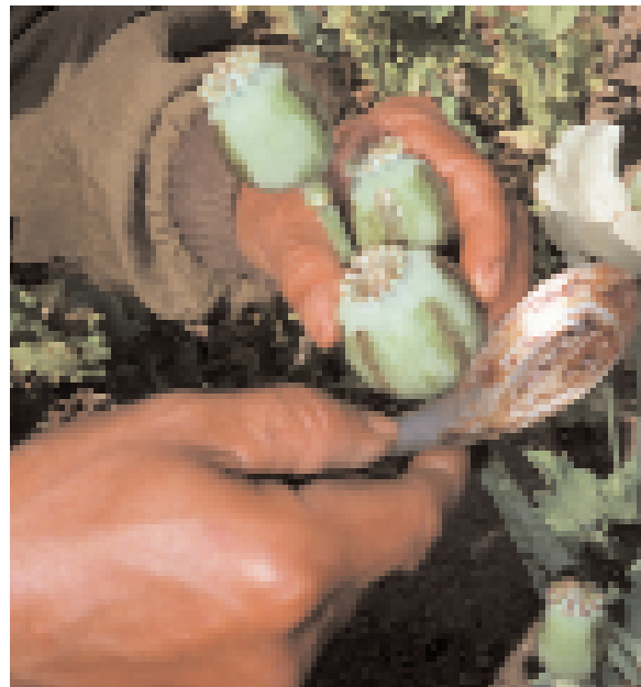
Illegal opium production.

toward the de-facto decriminalisation of personal possession and use of drugs, bending (sometimes to near breaking point) the nominally rigid prohibitions of the conventions. This decriminalisation trend has most commonly been associated with cannabis but in a number of countries it includes all drugs. It is a challenge to both the letter and spirit of prohibitionist legislation and will inevitably lead to more reasoned consideration of supply-side reforms. Whilst wider moves towards legalisation are still some time away, the decriminalisation trend appears to point the way to a challenge from a coalition of progressive states to reformulate or withdraw from the UN conventions. The aim will be to allow locally determined regulatory systems and bilateral trade agreements to be established.