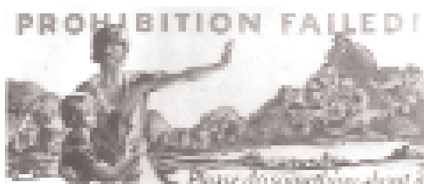
Poster from the Democrat campaign to end alcohol prohibition in the US, 1930s