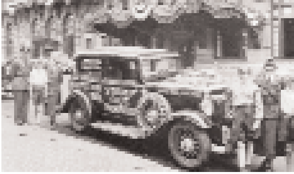
Families campaigning against alcohol prohibition in 1930s USA

the European Monitoring Centre for Drugs and Drug Addiction (EMCDDA) has recently commented that 'overall, the drug use trend remains upwards and new problems are emerging'(2).